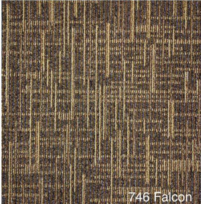
LINEN 746 FALCON