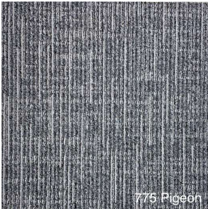
LINEN 775 PIGEON